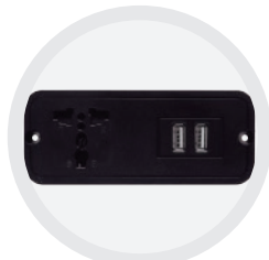
Multi-zone socket with USB